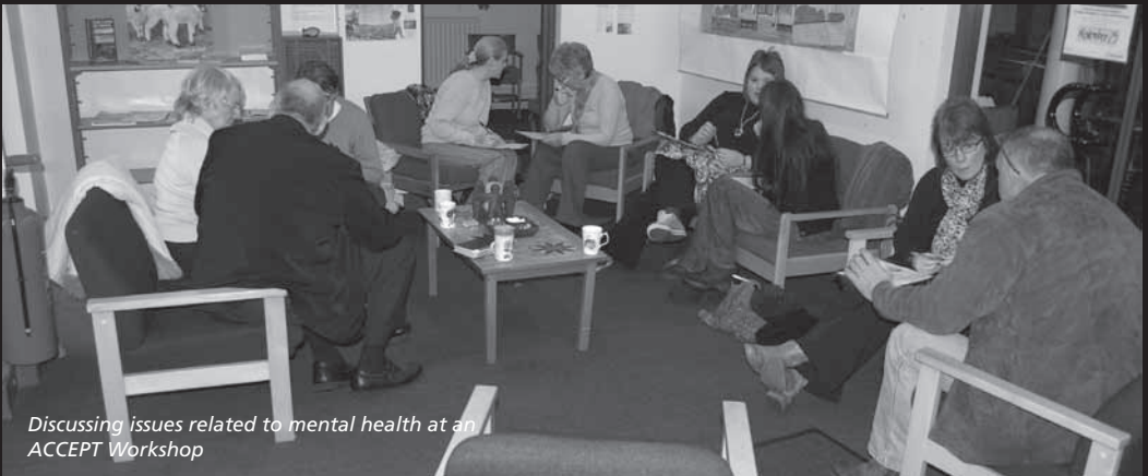
Discussing issues related to mental health at an ACCEPT Workshop

As an Occupational Therapist within an Adult Community Mental Health Team, one of my roles is working in partnership with ACCEPT in relation to Social Support Groups. These groups provide the opportunity for people to build a social network by meeting on a weekly basis in a community setting. Isolated individuals are referred to the group by the NHS and other mental health service providers.